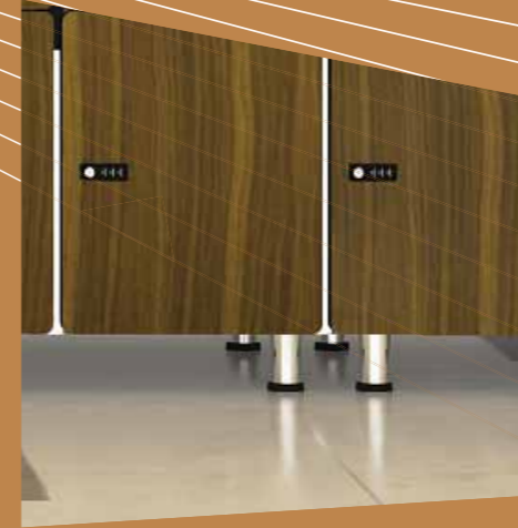
STAINLESS STEEL LEGS