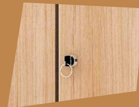
KEY LOCK INBUILT