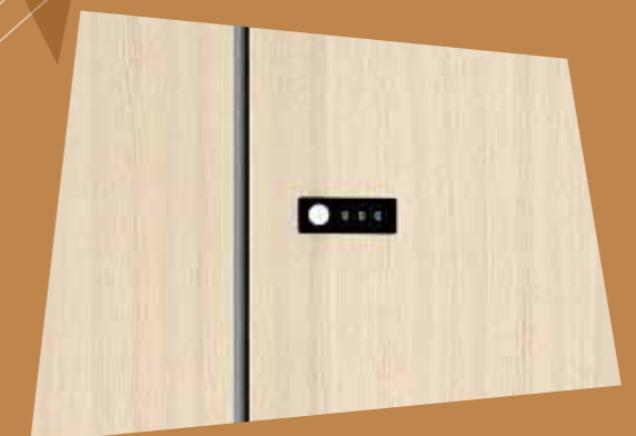
KEY LESS LOCK( NUMERIC)