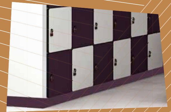
SKIRTING OF COMPACT LAMINATE